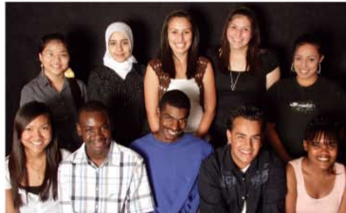
2007-08 Bridge Project High School Graduates